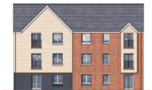
Front Elevation (Ward Street)