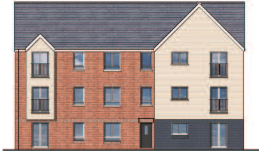
Front Elevation (Hall Park Street)